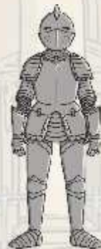
suit of armour